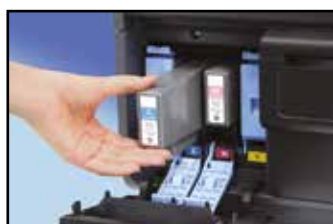
Simple ink cartridge replacement

* Specifications subject to change without notice