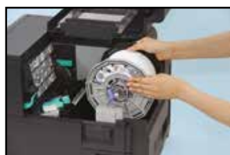
Easy label roll replacement